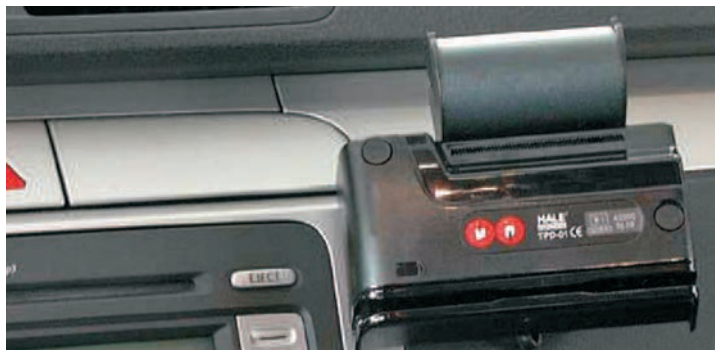
Printer also available with magnetic card reader

Low current consumption corresponds to the automotive standards. The HALE TPD-01-BT consumes current only during printing (automatic wake-up via interface) and is otherwise in sleep mode.